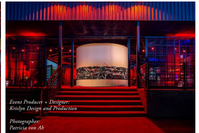
Event Producer + Designer: Krislyn Design and Production