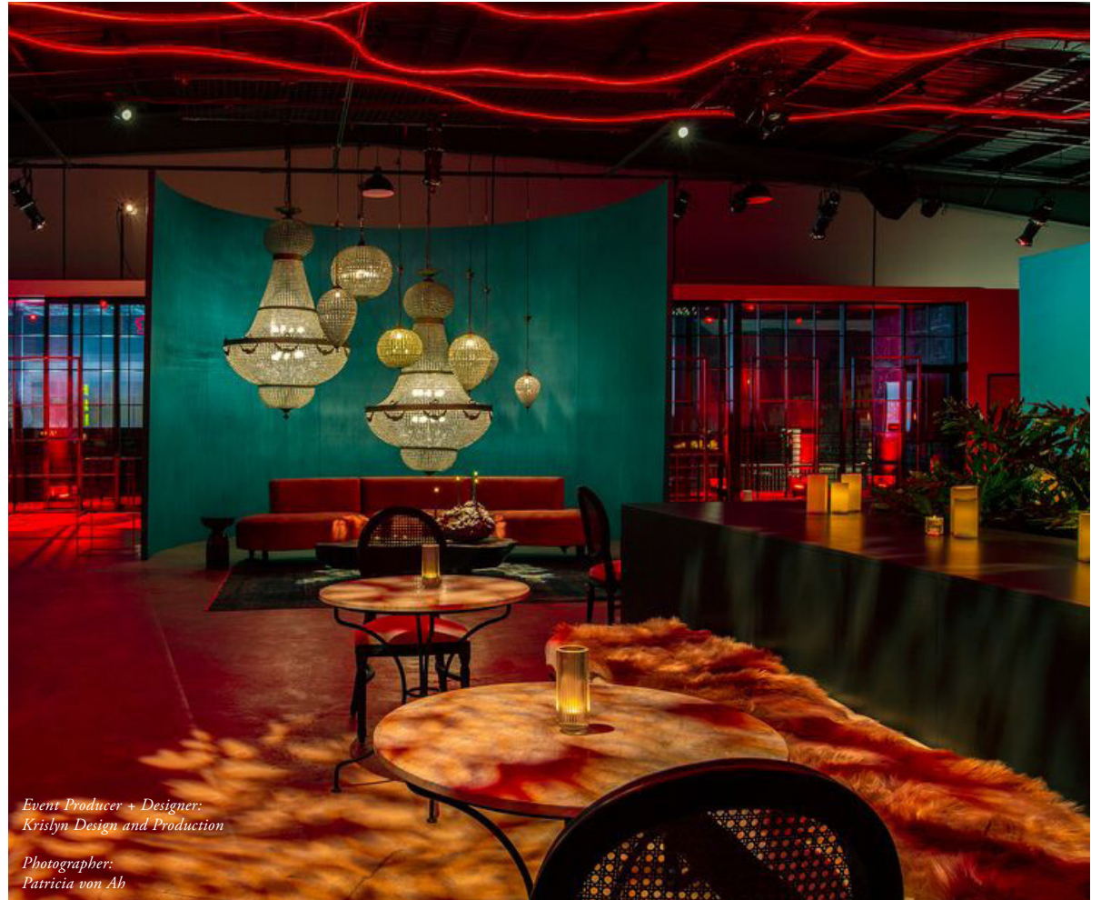
Event Producer + Designer: Krislyn Design and Production