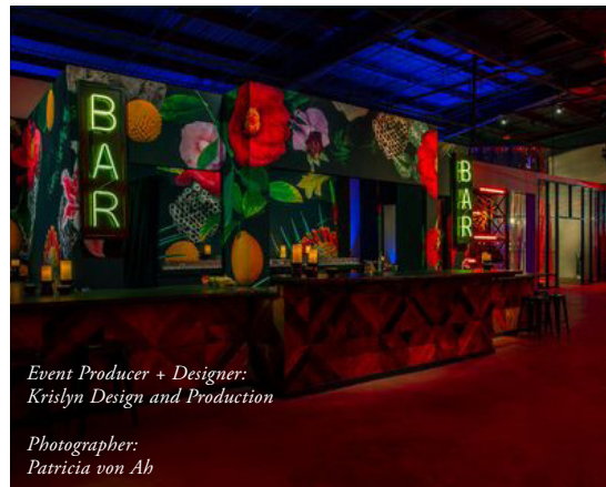
Event Producer + Designer: Krislyn Design and Production